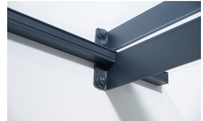
Back sealing gasket & complete wall mounting kit included